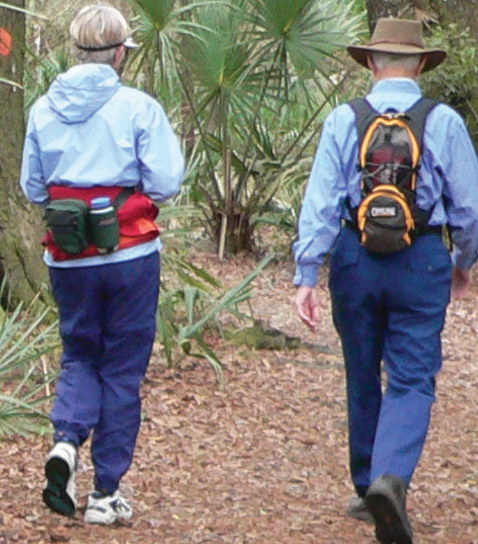
Crossing Central Florida from the Gulf of Mexico to the St. Johns River